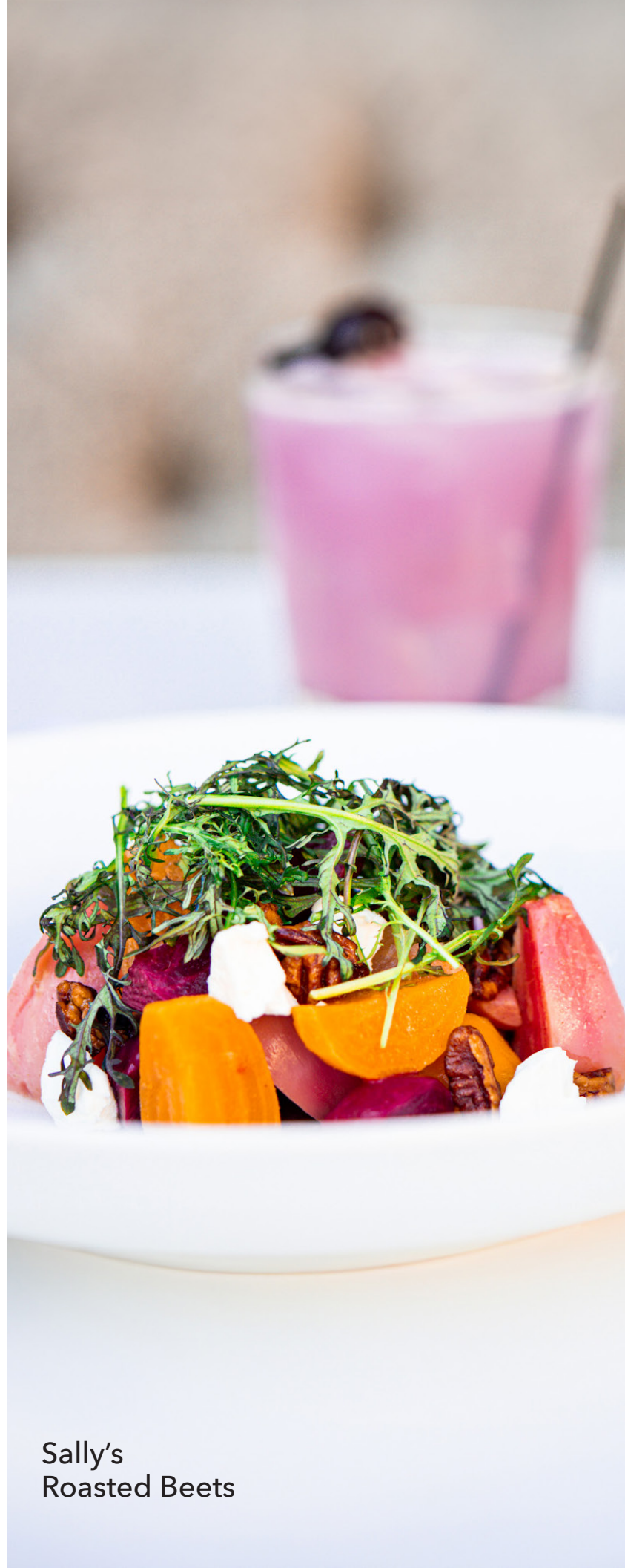
Sally's Roasted Beets

Price does not include service charge (currently 21%) or sales tax (currently 8.375%)