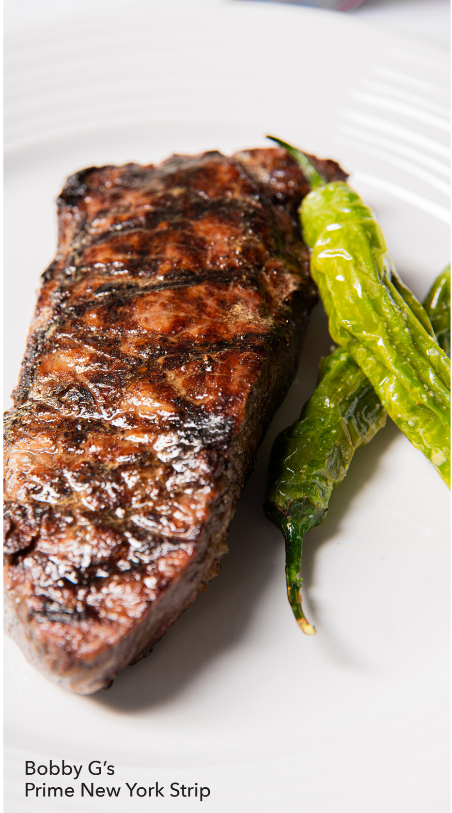
Bobby G's Prime New York Strip

New York Style Cheesecake & Chocolate Cake