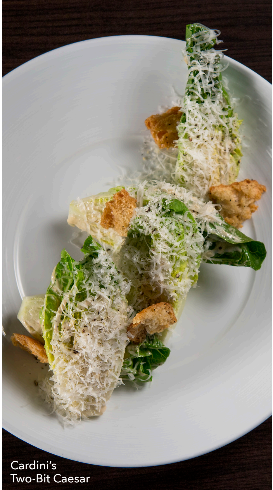
Cardini's Two-Bit Caesar

Price does not include service charge (currently 21%) or sales tax (currently 8.375%)