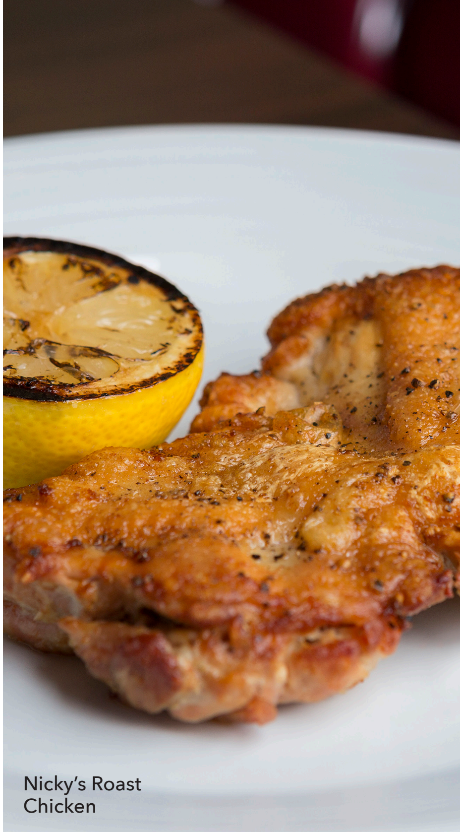
Nicky's Roast Chicken

New York Style Cheesecake & Chocolate Cake