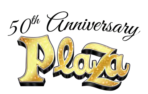
HOTEL • CASINO • BINGO